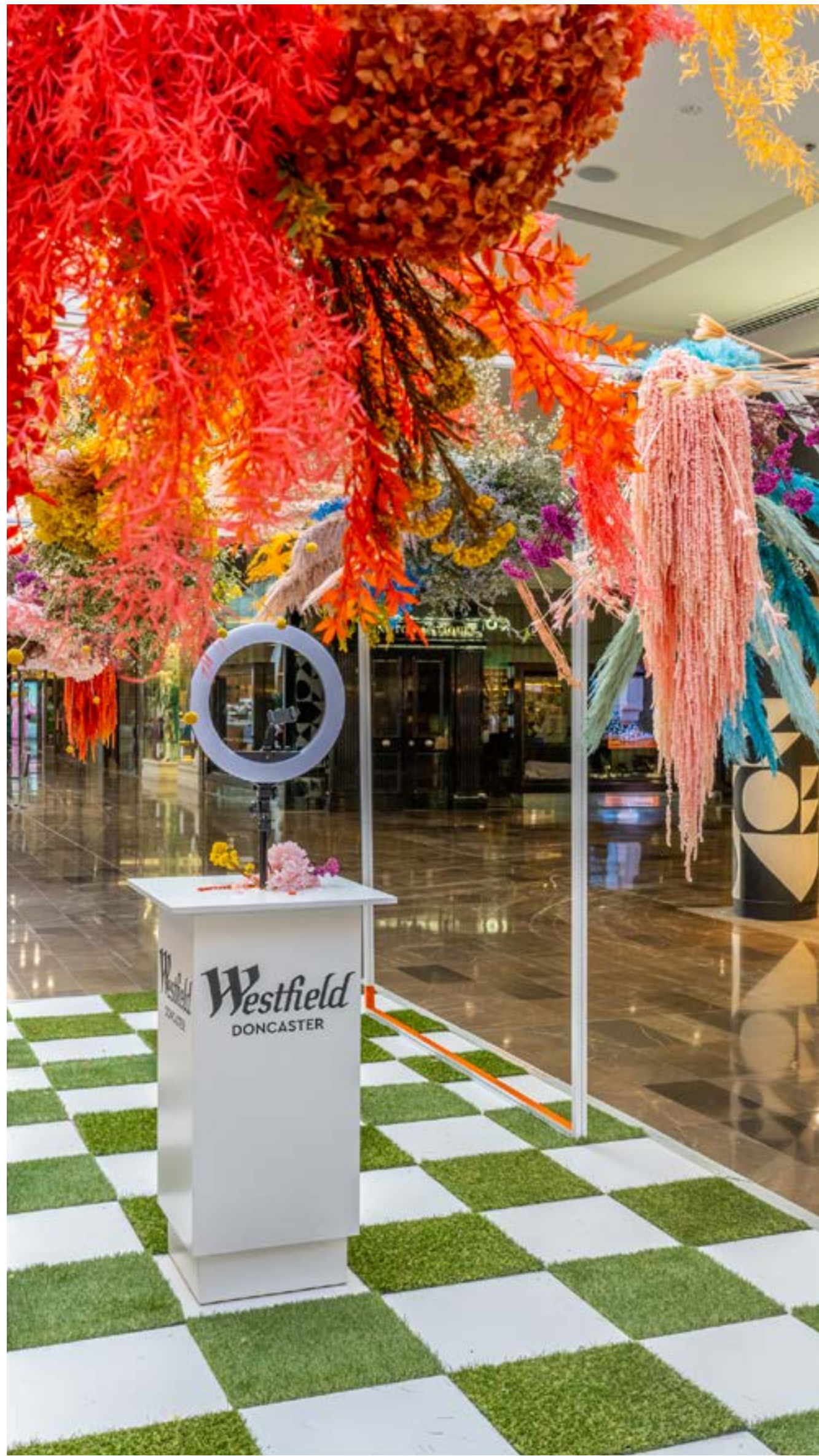
BRAND ACTIVATION SOLUTIONS