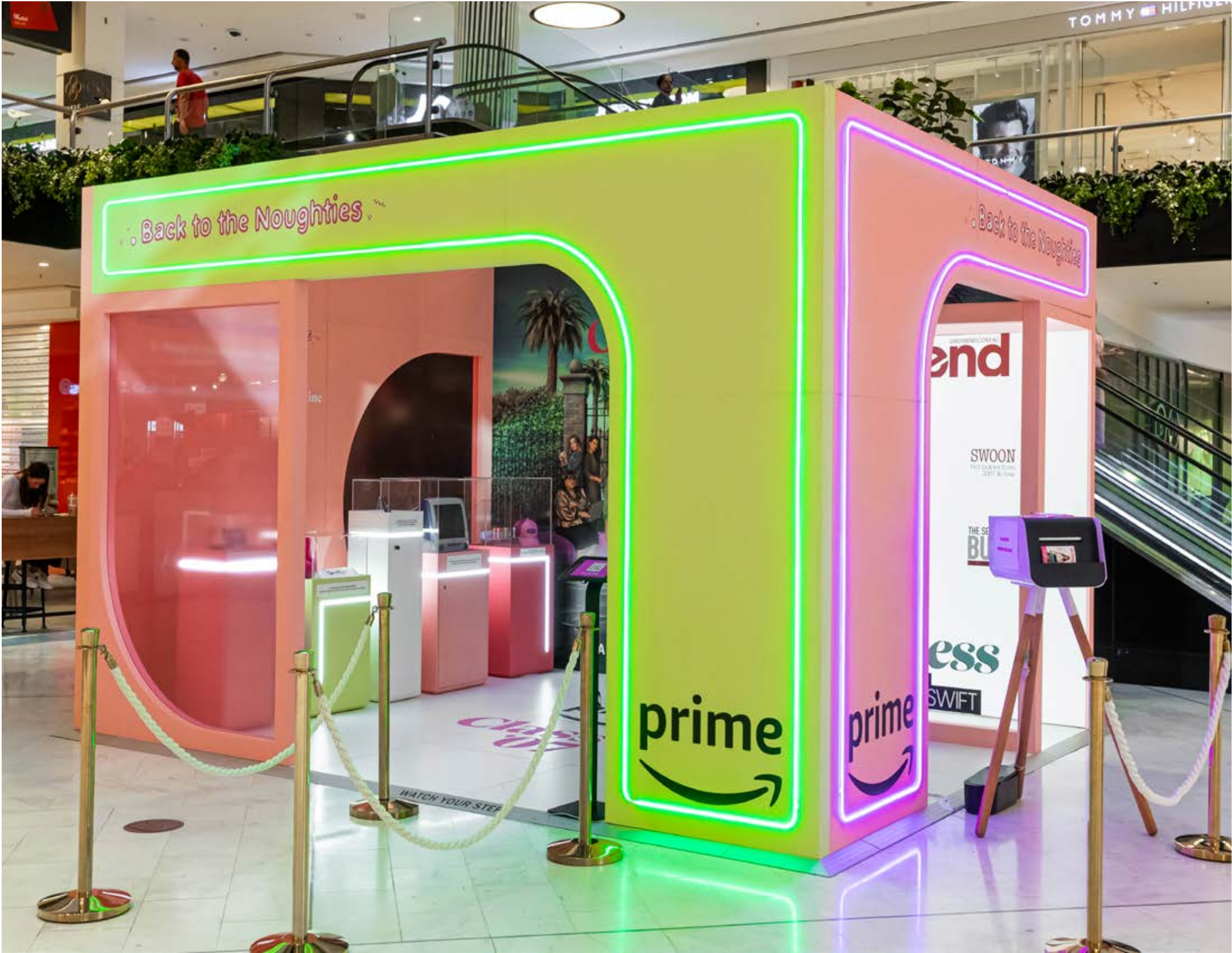
BRAND ACTIVATION SOLUTIONS