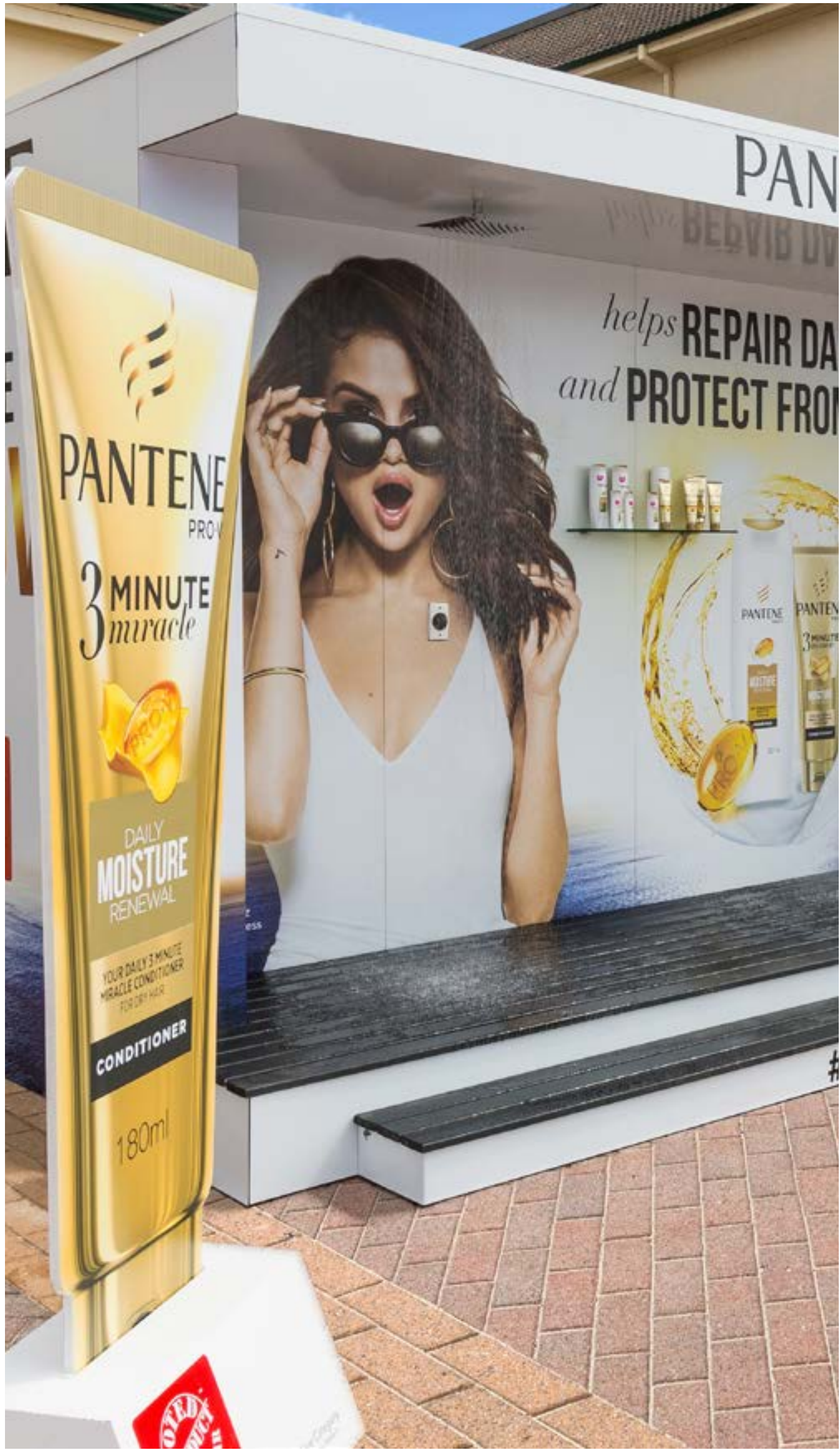
BRAND ACTIVATION SOLUTIONS