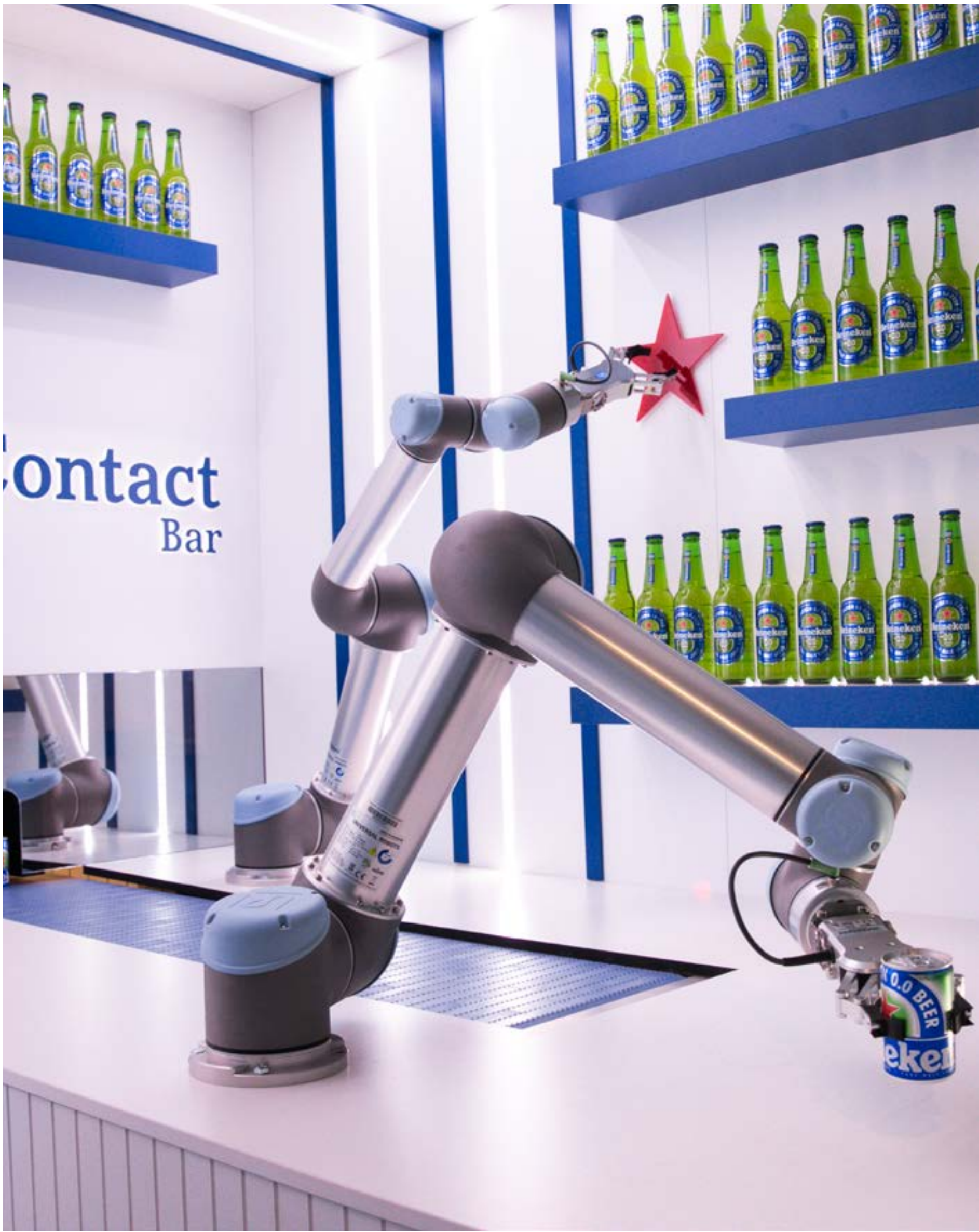
BRAND ACTIVATION SOLUTIONS