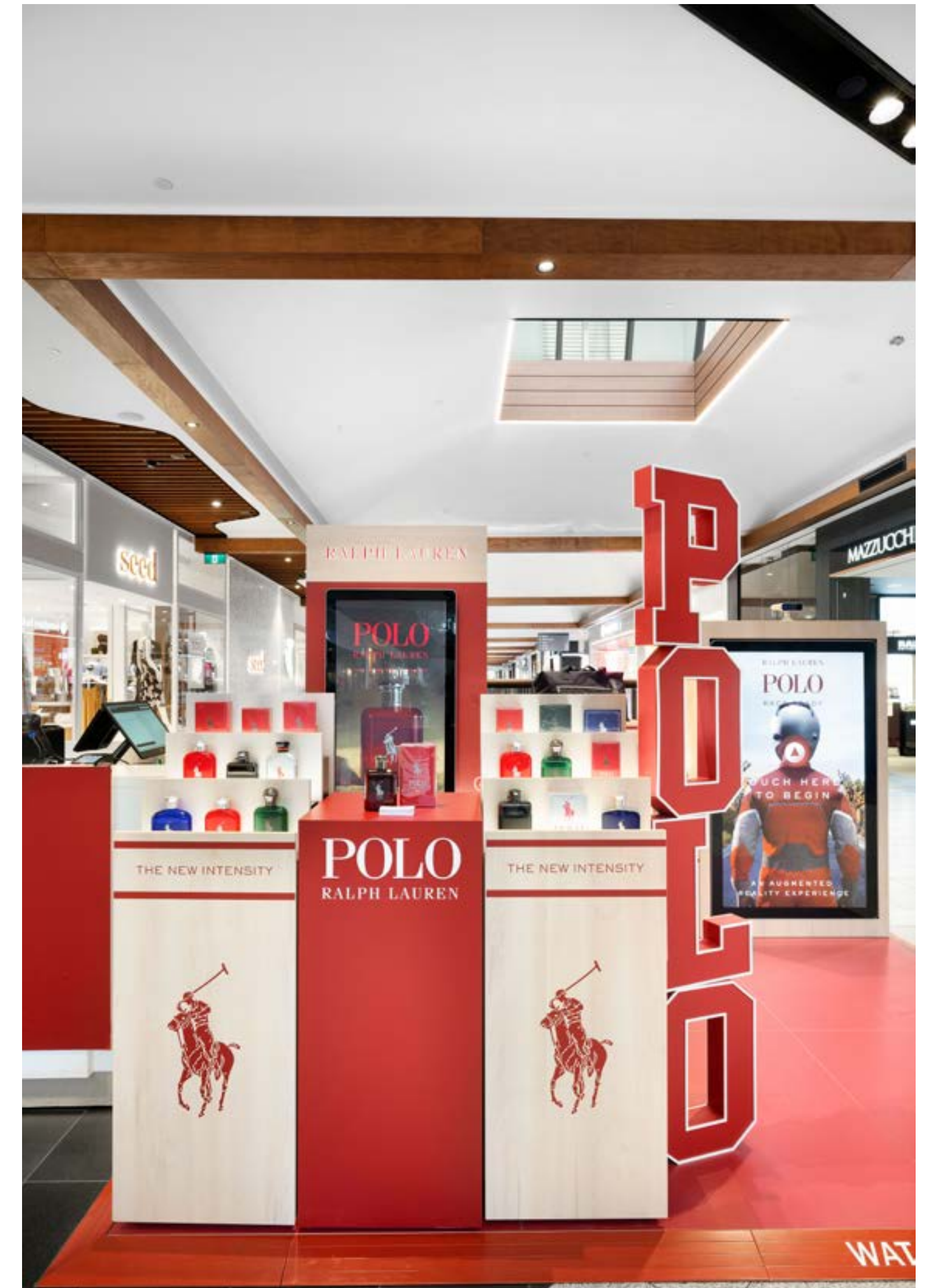
BRAND ACTIVATION SOLUTIONS

Carts and booths are a perfect alternative to brands having to rent a larger space, particularly when wanting to promote a product or service during key calendar times such as holiday periods. They are a great idea for brands seeking a portable structure in temporary locations.