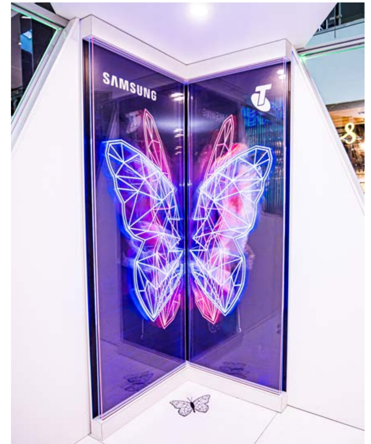
BRAND ACTIVATION SOLUTIONS

Our national installation capability and trusted partner network ensures your activation can be delivered to multiple sites seamlessly, without the need for you to engage additional suppliers or contractors.