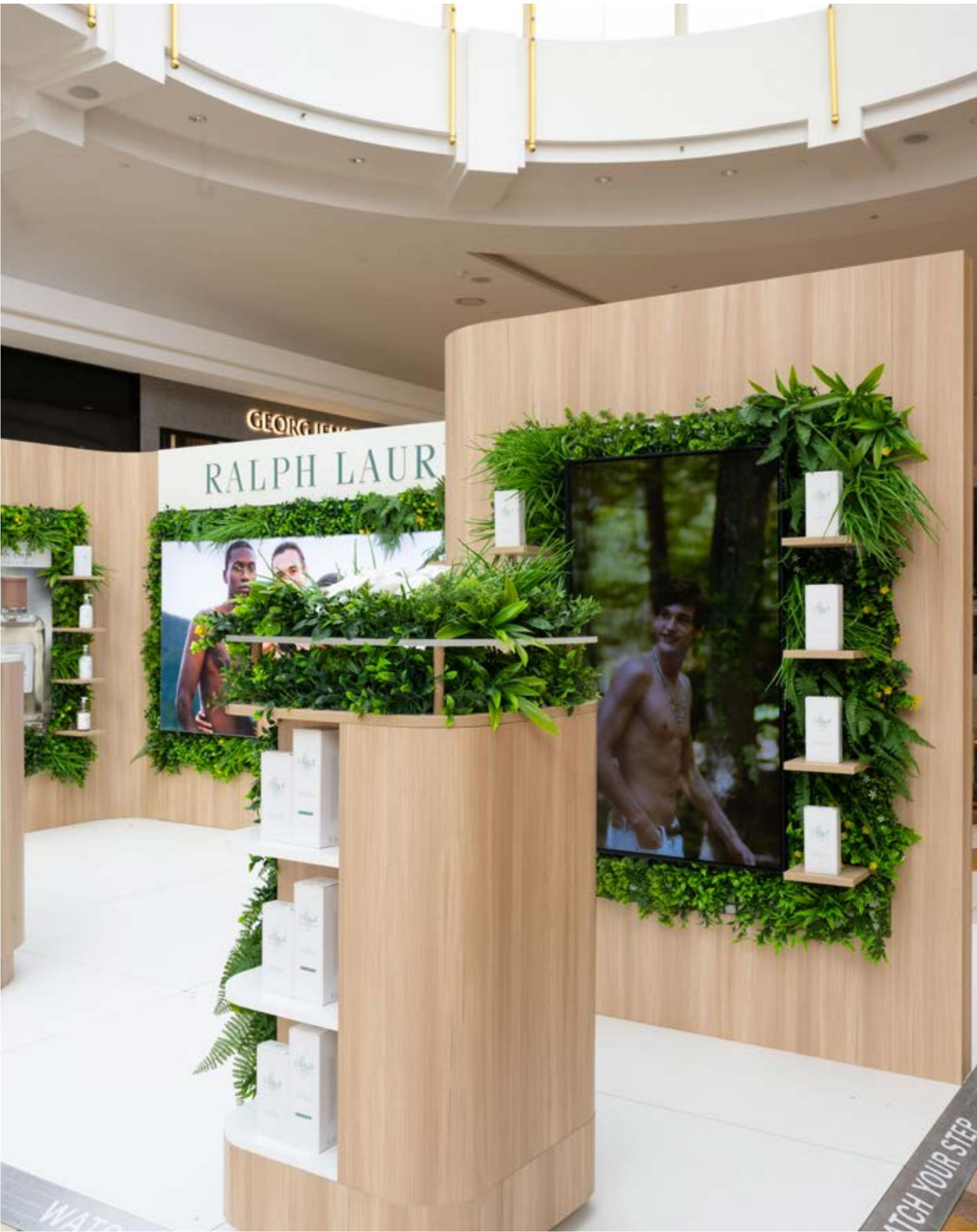
BRAND ACTIVATION SOLUTIONS