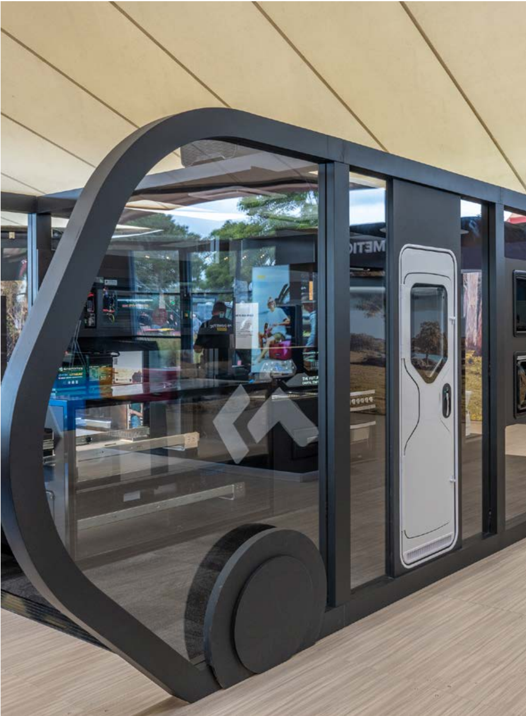
CUSTOM STAND SOLUTIONS