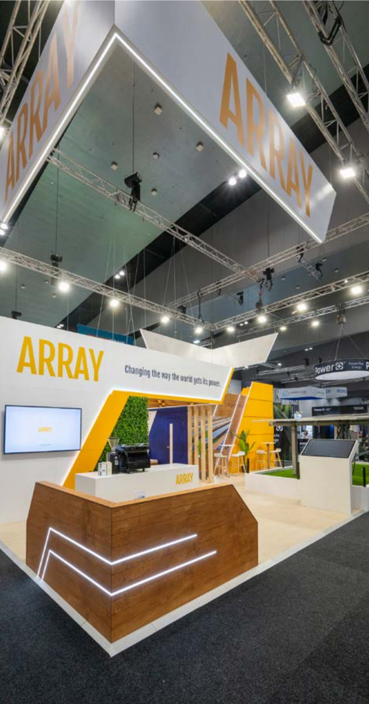
CUSTOM STAND SOLUTIONS