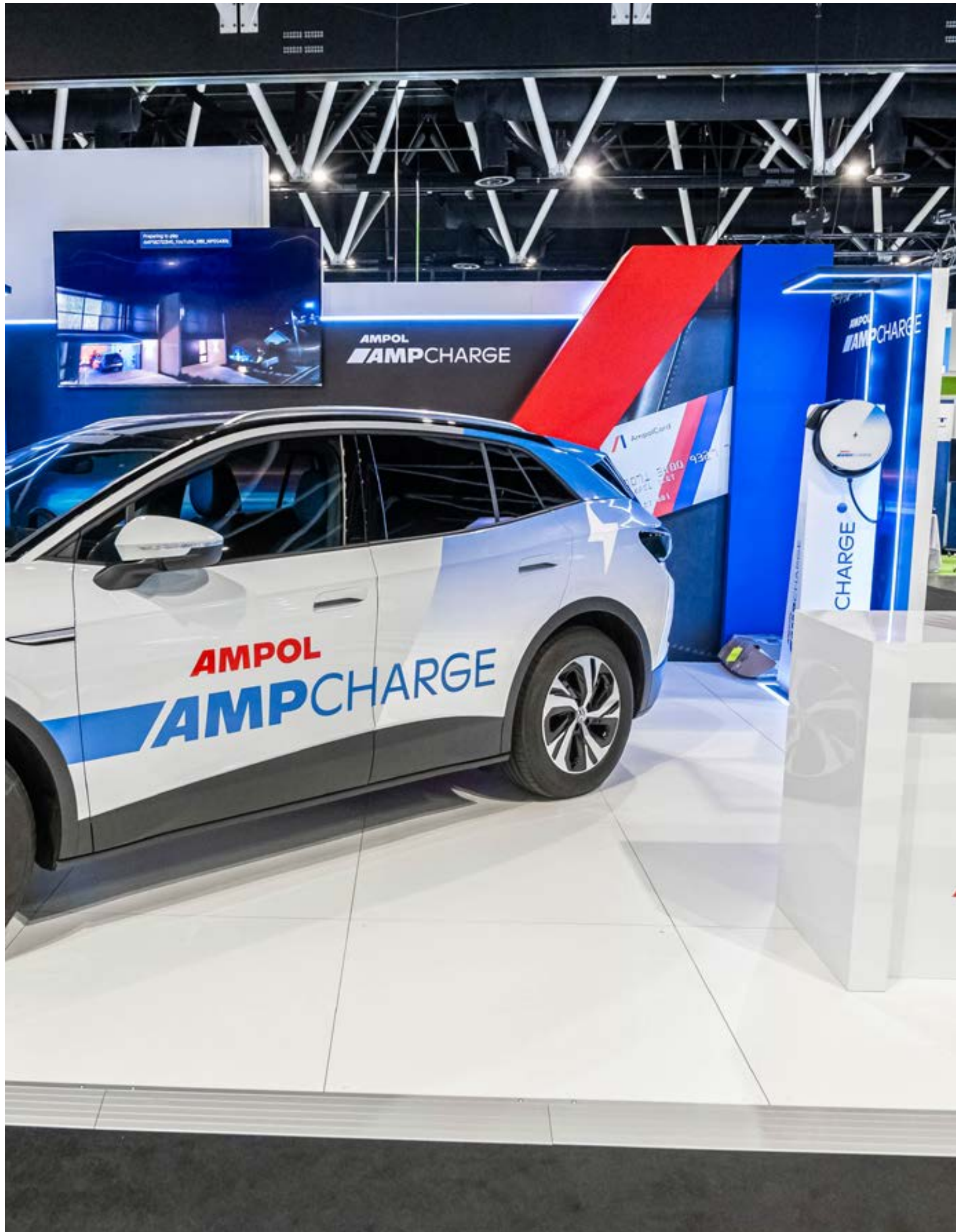
CUSTOM STAND SOLUTIONS