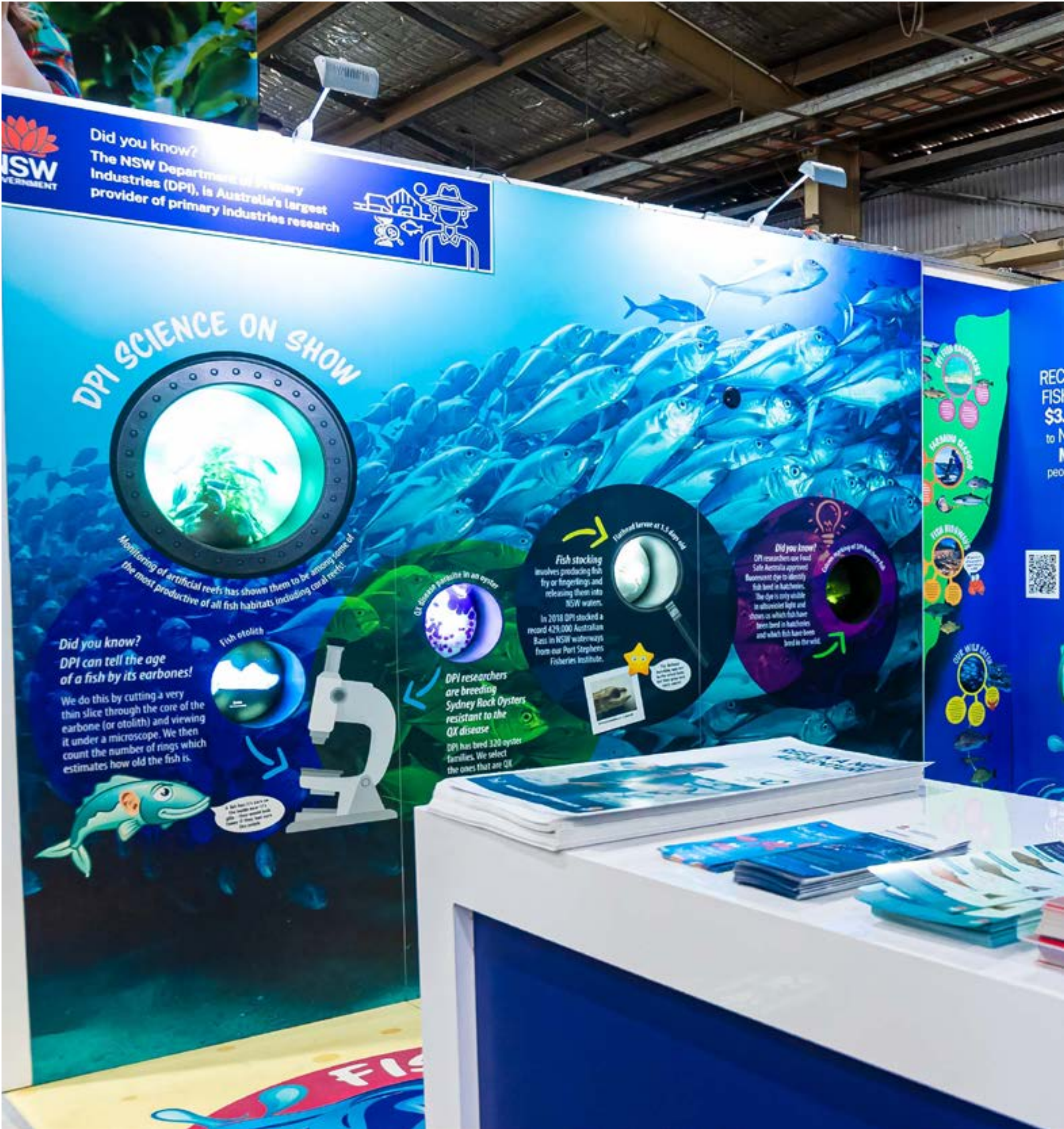
CUSTOM STAND SOLUTIONS